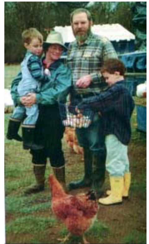
This photo is a few years old, but you get the idea!